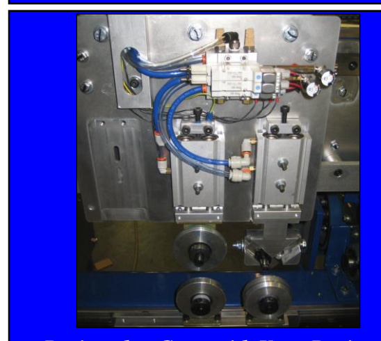
Designed to Grow with Your Business