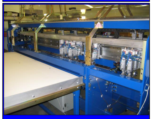
Rugged - Transparent - Accessible