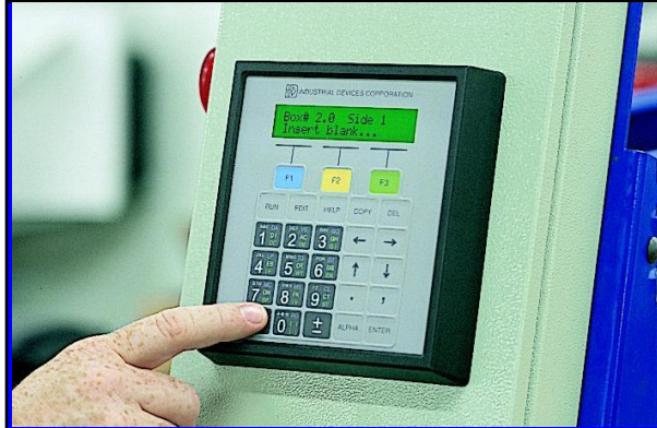
Setup 0201, RSC